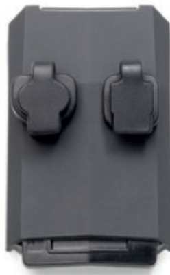
Includes Hardwire Door & cables (MH-HWD)