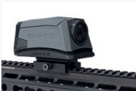
Picatinny rail mount

Includes Multi-Mount, picatinny adaptor, action camera adaptor (MH-MM)