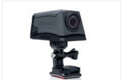
Action camera mount