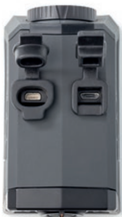
Micro HDMI and Micro USB ports