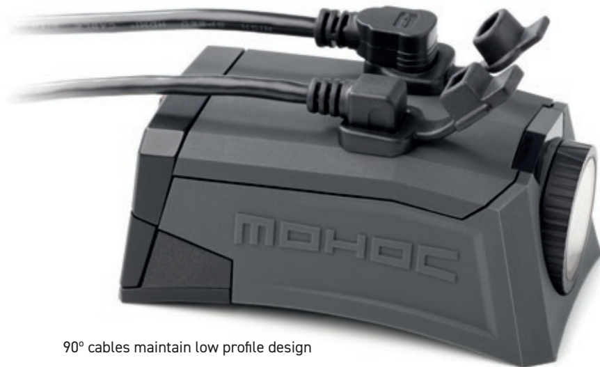
90° cables maintain low profile design

The Hardwire Door is easily installed even when wearing gloves, and interchangeable with the standard door when complete waterproofing is required. Compatible with MOHOC®, MOHOC® IR (not compatible with MOHOC® 2).